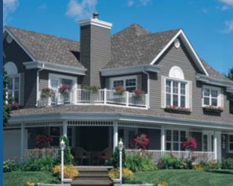
Front Cover: Select Laminates Double A.5™ Designer in Mountain Crests with matching Outside Corner Trim. Shown: Journeymen Select Double A™ Traditional in Dark Gray complemented with Royal Premium Interlocking Trim in Black.